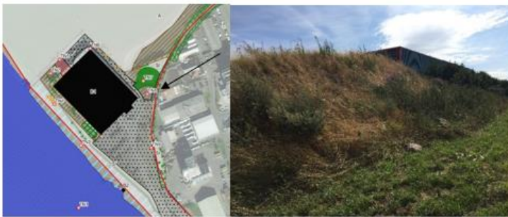
Figure I1: Location and photograph of Himalayan balsam within Order Limits

4.2.2.1 Himalayan balsam has been identified at a single location within the Railway Reinstatement Land, growing amongst tall ruderal vegetation on a raised earth bund beside a building on the north-west side of the Flixborough industrial estate (Figure I1). Surveys also noted additional areas of Himalayan balsam along the River Trent, however these are outside of the Order Limits.